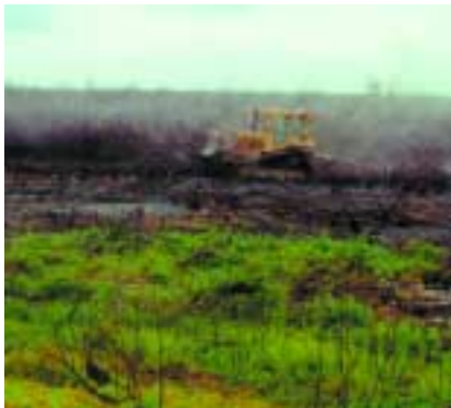
Controlling large stands with bulldozers and fire.

When using herbicides always read the label and follow instructions carefully. Particular care should be taken when using herbicides near waterways because rainfall running off the land into waterways can carry herbicides with it. Permits from state or territory Environment Protection Authorities may be required if herbicides are to be sprayed on riverbanks or directly onto the water.