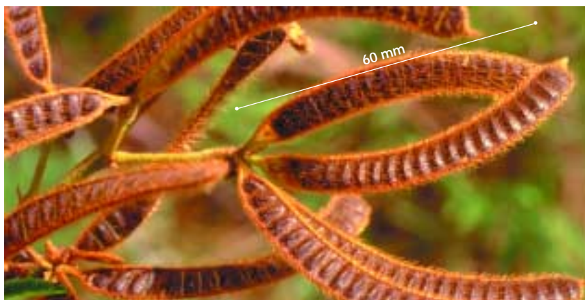
Ripe mimosa seed pods ready to drop at Finniss River, NT, in July.

Much of northern Australia is climatically suited to mimosa. The infestation at Proserpine, which is outside of its projected distribution, indicates that it may actually be able to survive further south than its potential distribution suggests.