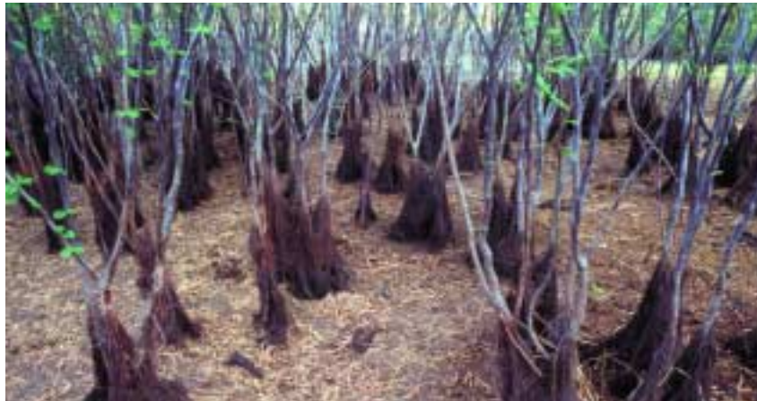
Mimosa stands outcompete virtually all other forms of vegetation.

The complete eradication of mimosa in Kakadu National Park is therefore a long-term program, which is crucial to the maintenance of the World Heritage wetlands of Kakadu.