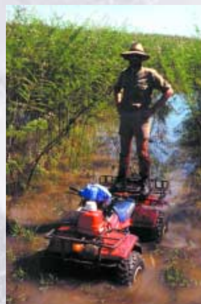
Infestation in the Adelaide River, NT, in April.

mechanical and burning treatments, and ensure biocontrol agents are still present, until mimosa is eliminated or can be effectively managed.