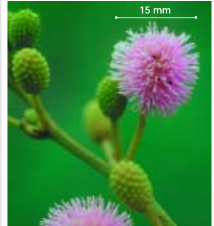
Mimosa mainly flowers during the wet season.

Mimosa was first brought into the Northern Territory to the Darwin Botanic Gardens around 1891. Its spread around Darwin over the next 60 years was not particularly conspicuous, until a large infestation was discovered in 1952 at Adelaide River, 100 km south of Darwin. It was then correctly identified as Mimosa pigra , and its invasive tendencies were revealed as it spread downstream. It is believed that sand contaminated with