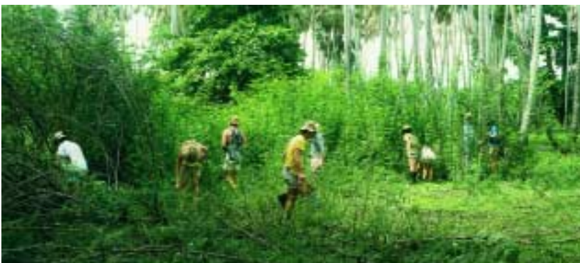
Community control of mimosa at Black Jungle, near Darwin, NT.

Granular herbicides target roots and should be placed near mimosa bushes before rain is likely to occur. However, the effectiveness of root-absorbed herbicides varies with soil and land types. Consult your state or territory government agency to determine the most appropriate herbicide for your local conditions. Although residual herbicides provide some protection from future germination of mimosa seeds, the growth of other preferred trees and shrubs will also be inhibited if their roots encroach into the treated area.