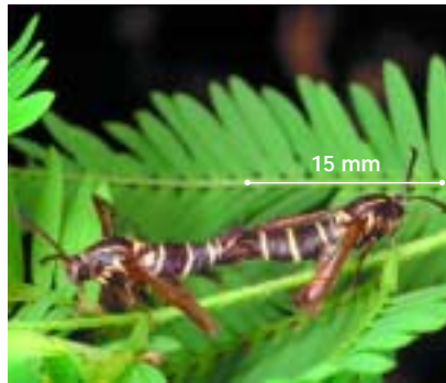
Adult Carmenta mimosa moths mating on a mimosa stem. The grubs tunnel into the stems.