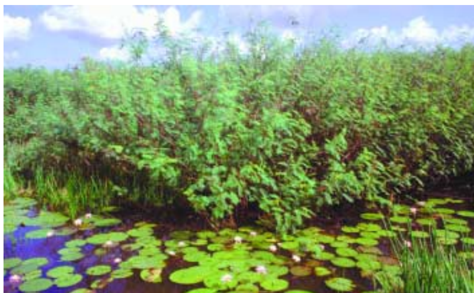
Mimosa invading wetlands on the Adelaide River floodplain, NT.

Mimosa is a branched prickly shrub, growing up to 6 m. The stem is greenish in young plants but becomes woody as